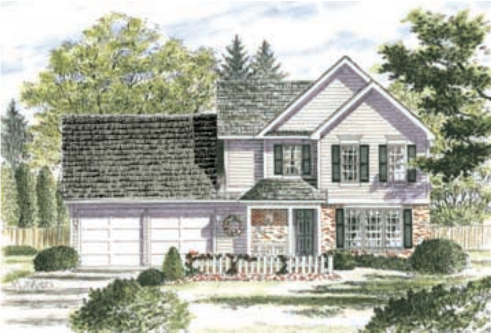
Front Elevations may vary depending on location.